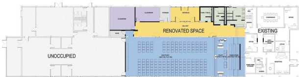
1 FLOOR PLAN - 3737 LAKE RENOVATION